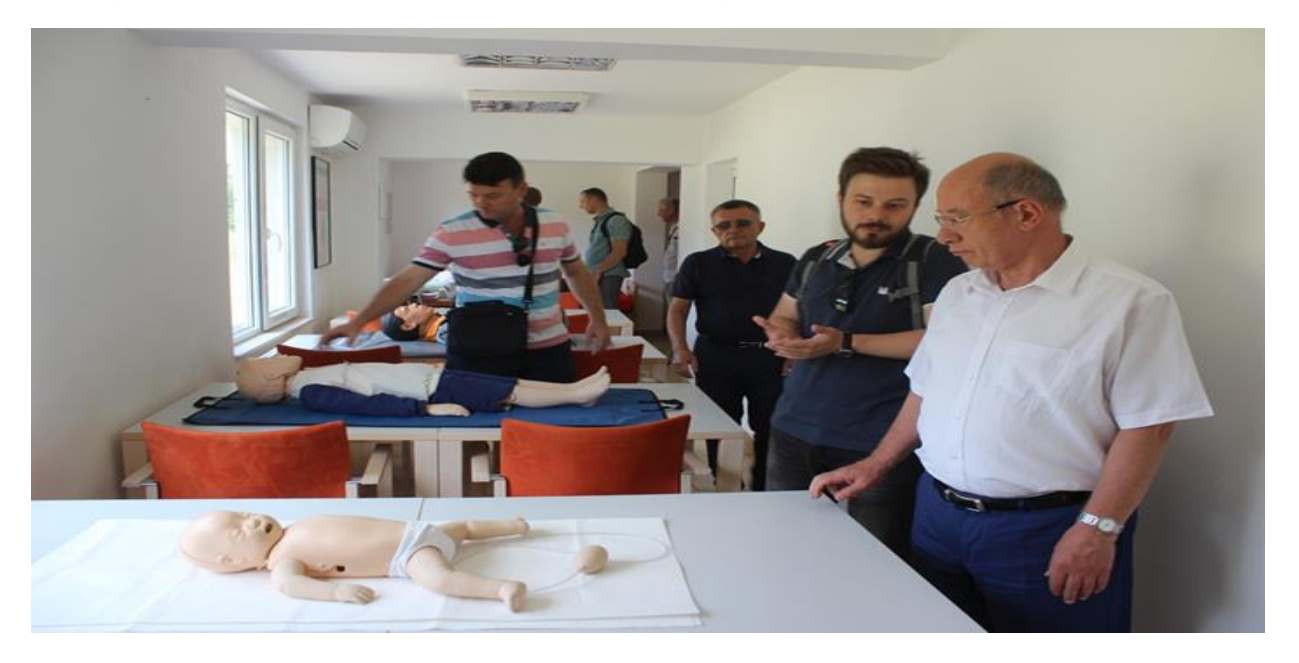
Bulgarian Red Cross Study Visit Bulgaria

Study visits and various applications were organized in or de to observe disaster and emergency applications in Europe, and to share good case practices.