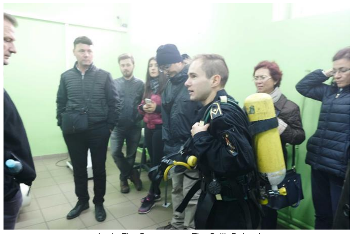
Lodz Fire Department Fire Drill, Poland