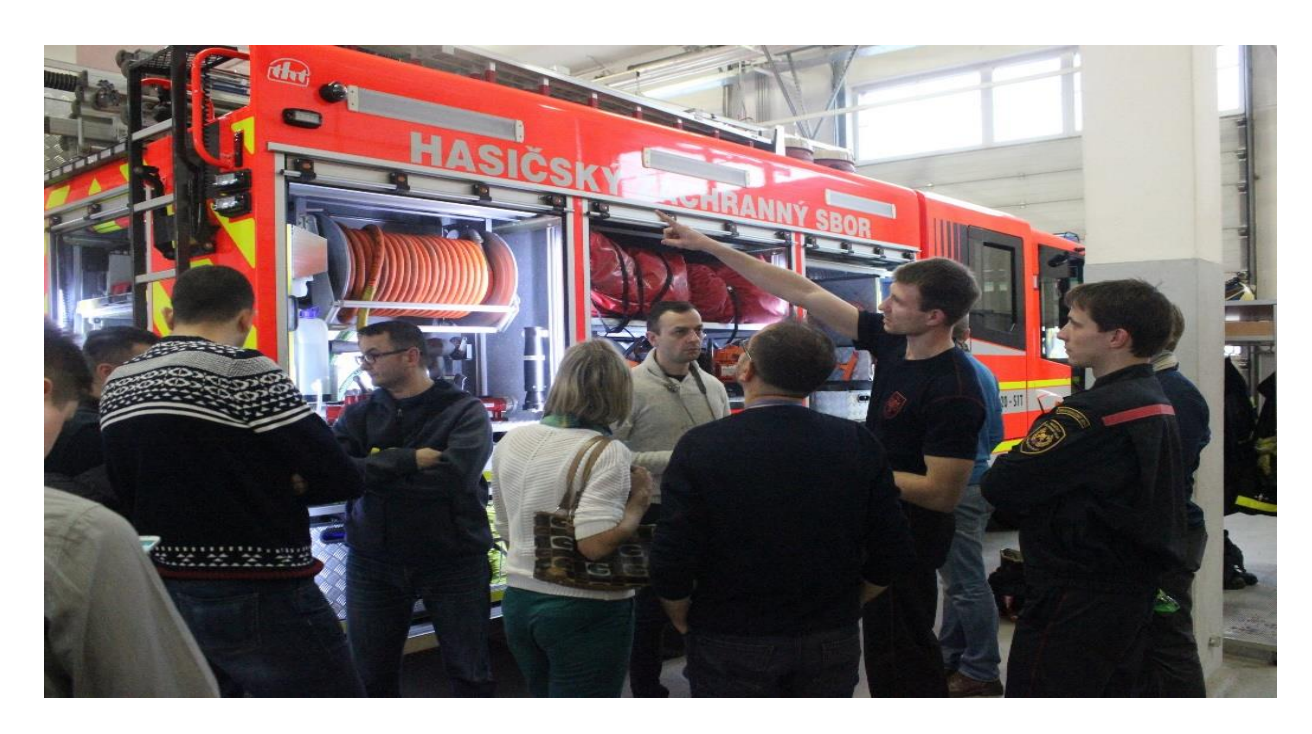
Consolidated Security Center and Emergency Department Study Visit, Ostrava/Czechia

Short term personel mobility meeting were organized with transnational partners. During these meetings, good practices are observed. In addition, group works were held for capacity building activities, and development of intellectual outputs.