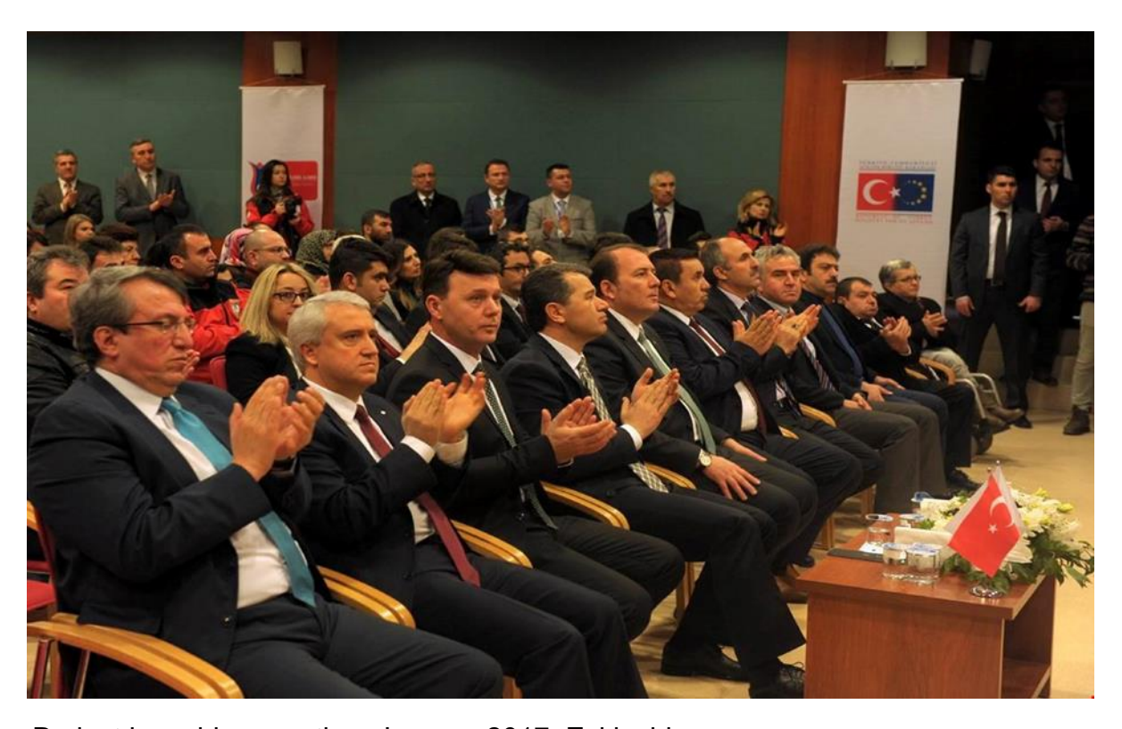
Project launching meeting, January 2017, Eskişehir

Kick-Off meeting was organized by participation of local and national disability associations, political and administrative authorities, academicians, project partners, and public and the project is started officially.